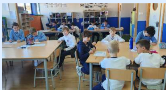
Around the world