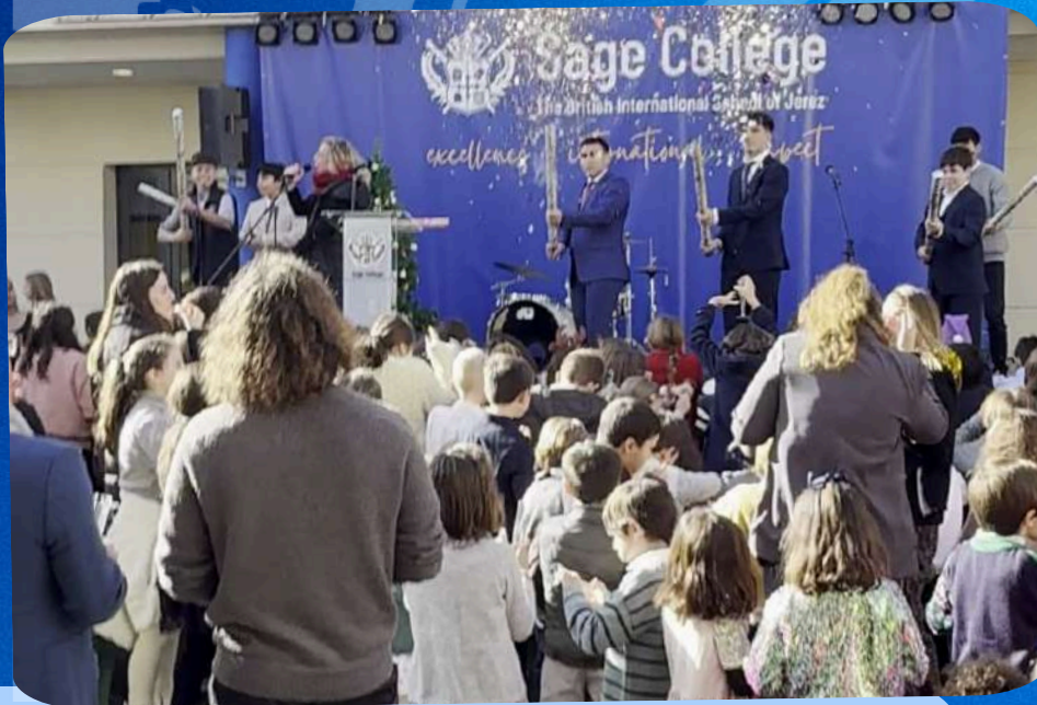
New Year's Eve Party 2024!!