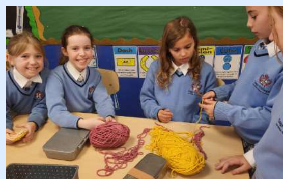
Art Skills Textiles