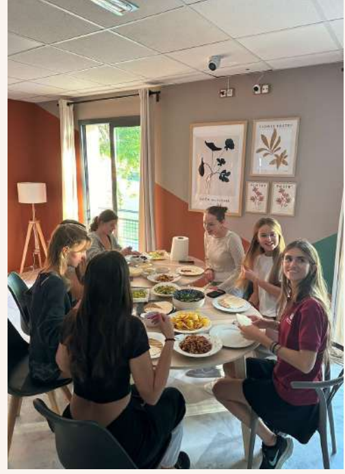
Finally, some of our boarders took the opportunity to use the boarders' kitchen to cook some of their own creations this week, and enjoy a meal in our newly refurbished common room.