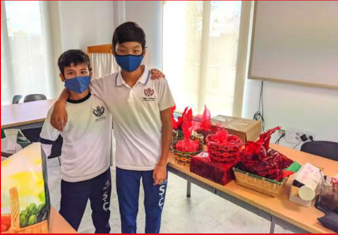
SANTA'S YEAR 7 ELVES HAVE BEEN PREPARING SOME DELIGHTS AT SAGE COLLEGE.