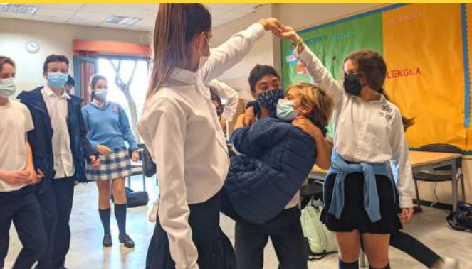
YEAR 9 PRACTICING THEIR GREAT FESTIVE DANCE