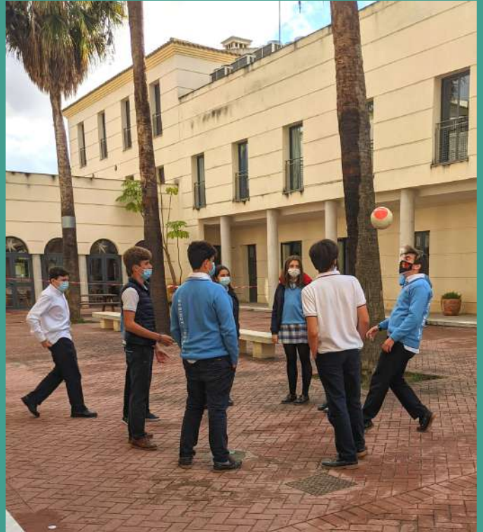
YEAR 10 PRACTICING FOR THE FOOTBALL TOURNAMENT NEXT WEEK. THE VARIOUS YEAR GROUP WILL BE HAVING A SERIES OF FRIENDLY MATCHES NEXT WEEK.